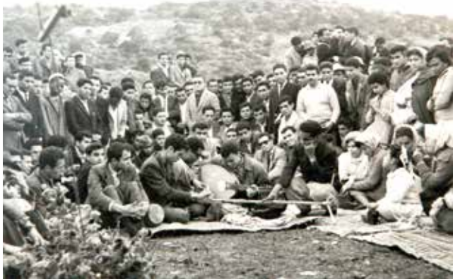
Benghazi University students gathering (1960)

35-47 Bethnal Green Rd. London E1 6LA 020 7613 7498 richmix.org.uk